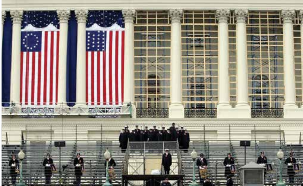
US Capitol Washington, DC Project Scope: Provide training and access expertise for the installation of the American flags that served as the background for President Obama's 2009 inaugural platform.