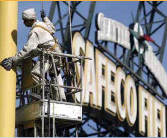
Safeco Stadium Seattle, WA Project Scope: Provided 2 line and single line powered access stages for painting the stadium.

"I have just received another Spider basket on my offshore rig. I have ordered a Spider basket for every rig I am assigned to and use the Spiders very successfully. My first job offshore was on a spy ship named the Hughes Glomar Explorer in 1974. We were raising a sunken Russian submarine and had 2 Spider baskets onboard the ship for that mission. Thanks for 39 years of working with Spider – it is a great product."