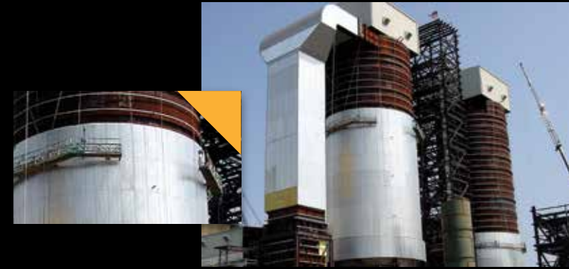
Brayton Point Power Station Summerset, MA Project Scope: Provided four 90 ft semi-circular platforms for installation of 200 ft insulated panels for a coal plant