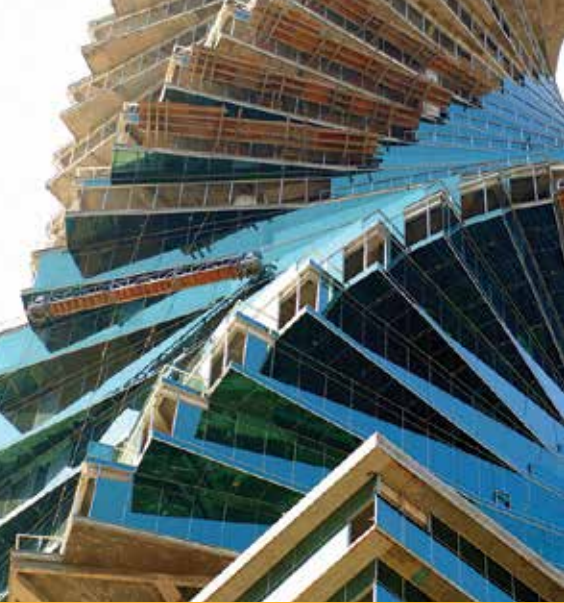
Revolution Tower Panama City, Panama Project Scope: Glass installation on both the vertical face and the underside of 48 projecting floor levels.