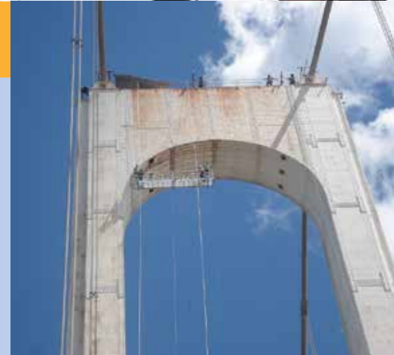
Angostura Bridge Venezuela Project Scope: Supplied multiple unique grated deck platforms powered by the premier SC1000 traction hoists to perform sandblasting and painting work