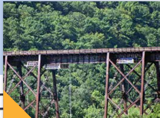
Metro North Railroad Moodna Viaduct Saulsbury Mills, NY Project Scope: Large area float access for structural repair of iron railroad viaduct